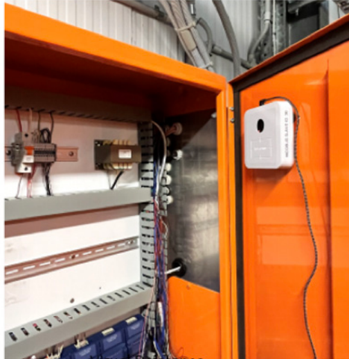
Installation 1: 240/24V transformer, top of right cabinet